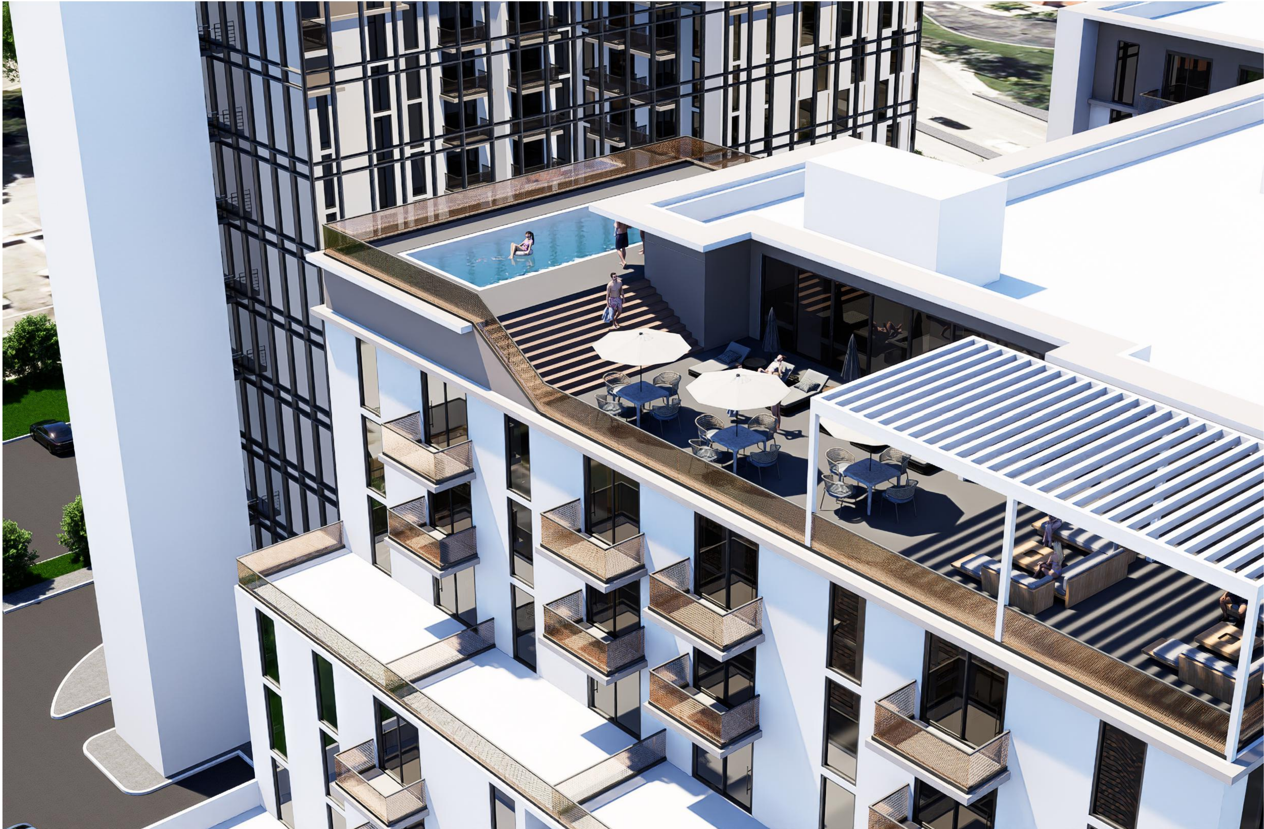
ZOOM-IN VIEW OF THE ROOFTOP POOL